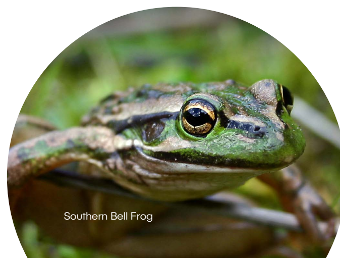
Southern Bell Frog

Your Bequest, be it small, medium or large, to the Foundation will significantly strengthen the longevity and impact of FAME's work.