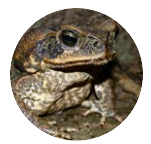
Cane Toad Eradication

Project Location: Kangaroo Island, SA. Current Population: Est. less than 300. Threat: Predation by cats, wildfire, habitat loss. Project Summary: Habitat Restoration, Monitoring, Feral Management.