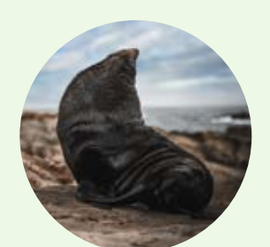
Support of a PhD Research Study

Gum across VIC and investigate their genetic diversity and connectivity. Project Summary: Habitat Restoration, Monitoring, Feral Management.